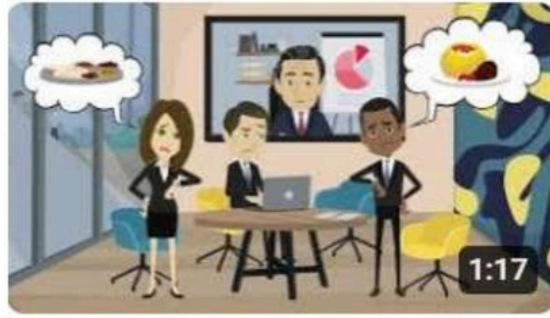
Go LoCo Catering Introduction

Watch this short video to see how Go LoCo provides a superior service while keeping those dollars right here at home where EVERYONE WINS!